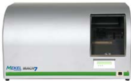
Digitizes up to 200 images per minute

In addition to the high-resolution camera used for image capture, Meke's microfiche scanners employ a separate prescan and title bar camera used for image location. With this unique configuration, the scanners skip the blank spaces on a fiche that is not full, allowing for a speed not seen in competitive units. As a bonus, these microfiche scanners have an optional load-arm that allows for the scanning of aperture cards.