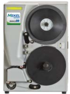
MACH5, 10 and the MACH Mini have a true optical dpi range of 100-600; speeds vary depending on dpi. The MACH12 can exceed 600 dpi resolution.

The MACH Mini, introduced in 2019, harnesses the image quality, editing features and efficiencies of the larger MACH models in a smaller footprint. Digitizing up to 350 images per minute at 200 dpi, the MACH Mini is portable and stackable, adding versatility to the MACH-Series product line.