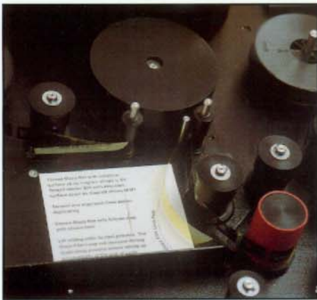
Exposure System ▲

The RB20m is ideal for medium volume users requiring a fast start diazo roll film duplicator for continuous or intermittent use. Typical production speed is 10 metres of film per minute dependant upon master film density and copy film type. No film splicing or splitting is required. Accurate speed and temperature controls enable duplication from a wide range of master film densities onto various colour diazo films with repeatable consistency of quality. Designed with the operator in mind the RB20m has many useful features.