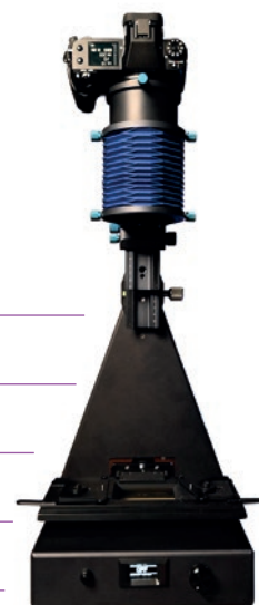
Fully Equipped Version