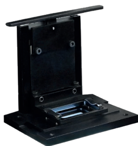
35 mm film strips