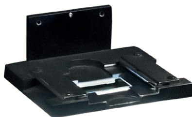
35 mm slides